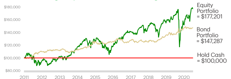
Chart 2: Investing in Equities vs. Bonds vs. Holding Cash, 2011 to 2020

Sources: Equities: S&P/TSX Composite TR Index, Bond Portfolio: Core Canadian Government Bond Index ETF, 1/1/11 to 12/31/20.