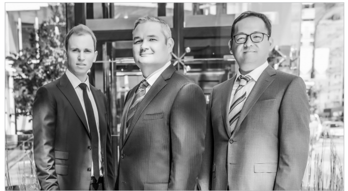
West Georgia Wealth

The real point, however, is not whether these arbitrary benchmarks can be achieved. Rather, Buffett's forecast was meant to inspire confidence in future growth, while asserting that we can all benefit from the market if we choose to participate. History has shown that equities outperform most asset classes over the long term; not surprising since they represent ownership of a growing economy. This is not to say that short-term setbacks won't happen — these