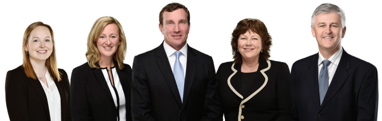
Anderssen Wealth Management TD Wealth Private Investment Advice