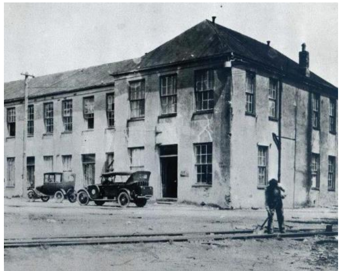
N. Adgers Wharf 1924 with a Lincoln Phaeton and Ford Model T Center Door

Talk with us about our wealth management services. Working together, we can develop a strategy and present customized strategies using our client-first philosophy and resources to help you work toward your financial objectives.