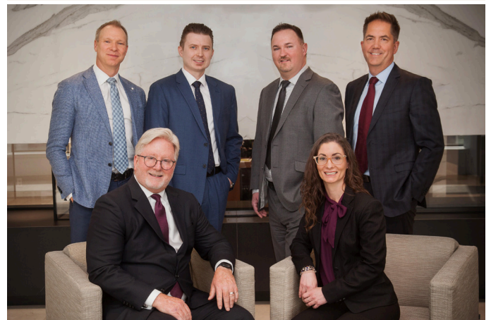
River Valley Group — TD Wealth Private Investment Advice